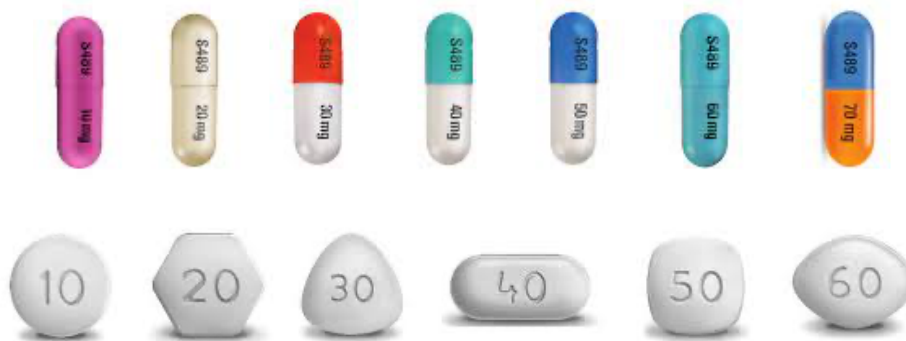
Figure 2: Quick Guide to ADHD Medication (Vincent 2019)

Dosages: Capsules 10, 20, 30, 40, 50, 60 and 70 mg. Chewable tablets: 10, 20, 30, 40, 50, 60 mg