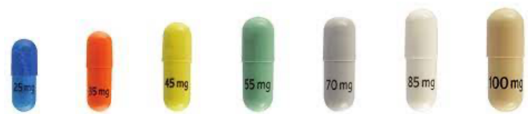
Figure 2: Quick Guide to ADHD Medication (Vincent 2019)

Dosages: Capsules come in 25, 35, 45, 55, 70, 85, and 100 mg