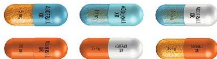
Figure 2: Quick Guide to ADHD Medication (Vincent 2019)

Dosages: Capsules come in 5, 10, 15, 20, 25, and 30mg