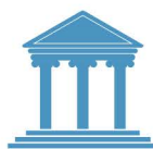
U.S. Government Representatives