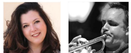
UPEI Music Alumni Series Page 5