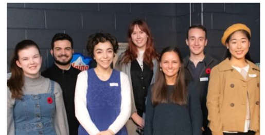
Dean's List Page 4