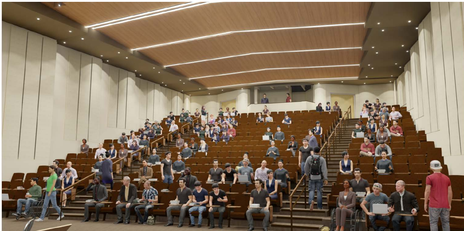
Artist's rendition of the new Performing Arts Centre, Stage View