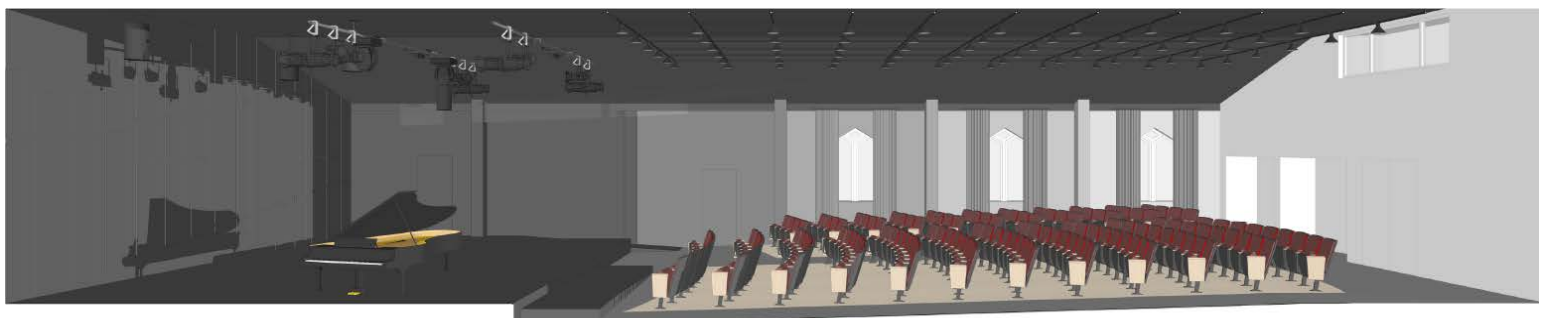
Artist's rendition of Steel Recital Hall renovations, Side View

The announcement of an upgrade of the Dr. Steel Recital Hall, together with construction of the new Performing Arts Centre, represent pivotal enhancements to UPEI's infrastructure. These will not only heighten interest at UPEI, but will enable community organizations, inclusive of schools, to have a forum to showcase their work. These improvements will be integral in providing those in the PEI Arts Scene with an additional venue to develop, create, imagine, and bring to fruition their visions. Information regarding UPEI's current fundraising campaign may be found at https://performingarts.upei.ca/ and https://www.upei.ca/communications/news/2021/08/upei-launches-3-million-campaign-support-performing-arts