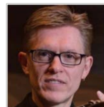
Tenure Track Positions Filled Page 4