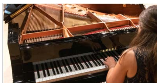
New Pianos Page 5