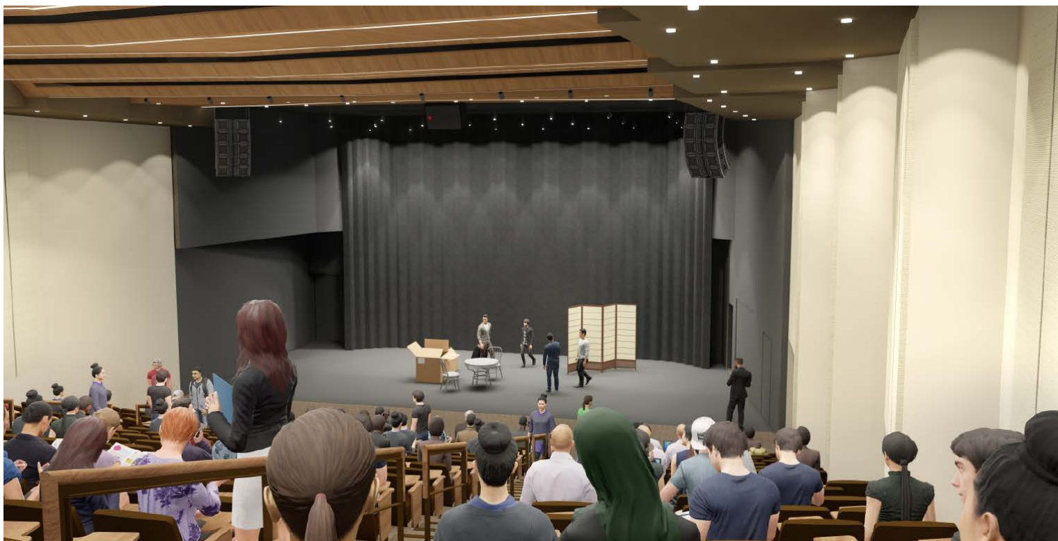
Artist's rendition of the new Performing Arts Centre, Back View