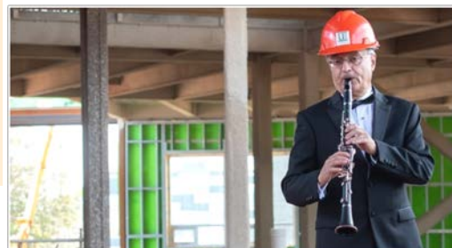
New Performing Arts Centre Page 2