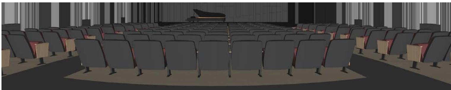
Artist's rendition of Steel Recital Hall renovations, Back View