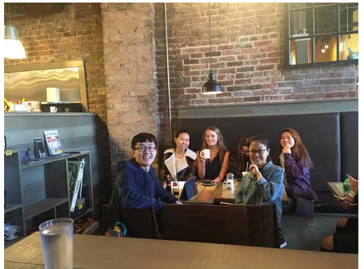
On May 12, the IRO hosted the first event in a series of events aimed to help EAP (English Academic Prep) students improve their English, and to promote new friendships between international and domestic students. The event began at UPEI, where the group took the bus downtown to the Kettle Black. The attendance was overwhelming! Almost forty students, student assistants and friends crowded into the Kettle Black for coffee and sweets.