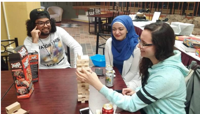
On May 6th, the International Relations Office hosted a board games and movie night in partnership with Student Life. Approximately twenty people were in attendance, taking part in games such as Jenga, Uno, Twister, and Munchkins.