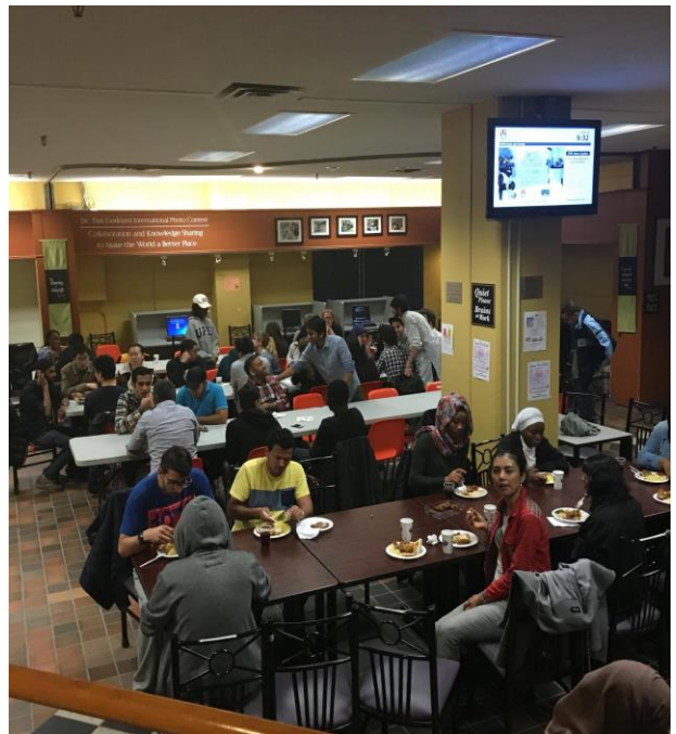
On June 15, the Muslim Student Association of Prince Edward Island hosted an iftar dinner for the UPEI student population. The dinner, completely free for students, was a huge success with about ninety attendants in total.