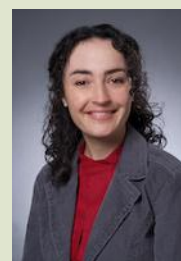
EAP Teachers & Coordinators