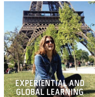
EXPERIENTIAL AND GLOBAL LEARNING